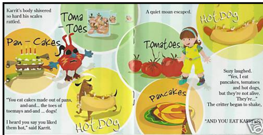
Excerpts from The Monster on Top of the Bed , Illustrated by Manuela Pentangelo